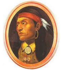
artistic interpretation by John Mix Stanley

$5, free to GWBHS & Time Travelers members.